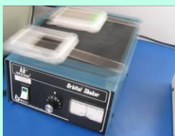
All incubation steps must be performed on an orbital shaker with 18+ mm orbital diameter