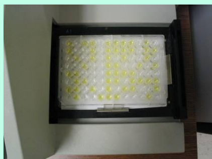
Read plates in a Plate Reader at 450 nm within 30 minutes of the addition of Stop Solution.

this wash step at least three times. After the final wash step, keep the plate inverted and tap firmly on a dry paper towel to remove as much Wash Buffer as possible.