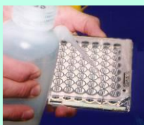
Bottle Wash method

Pull off particle-free extract to run in the test. Clarification of extracts by centrifugation is recommended (10 minutes at 1800-5000 x g), but not required.