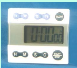
Add conjugate, mix, incubate, wash