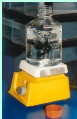
Prepare wash buffer and extraction solutions