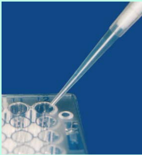
Add Extraction Buffer, controls, and sample extracts