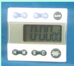
Add conjugate, mix, incubate, wash