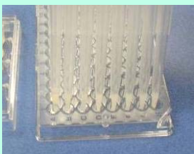
Add substrate, mix, incubate