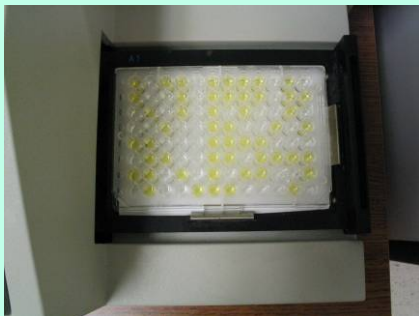
Read plate within 30 minutes of adding Stop Solution