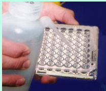
Bottle Wash method