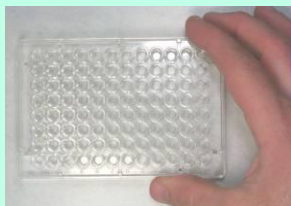
Mix plate, incubate