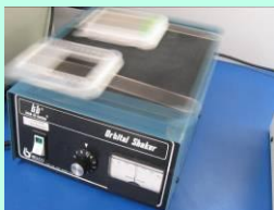
All incubation steps must be performed on an orbital shaker with 18+ mm orbital diameter