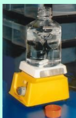
Prepare wash buffer and extraction solutions