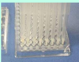
Add substrate, mix, incubate