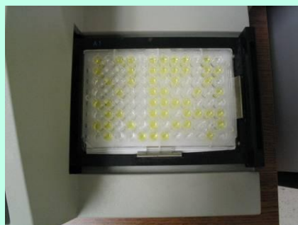
Read plates in a Plate Reader at 450 nm within 30 minutes of the addition of Stop Solution.