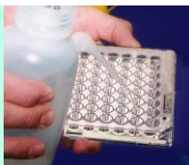
Bottle Wash method