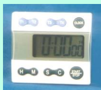
Add conjugate, mix, incubate, wash