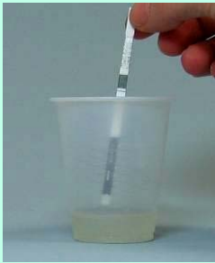
Insert strip into cup—be sure liquid level is at or above the arrows' tips but below the top of the arrow