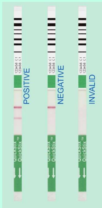
Any clearly discernable pink Test Line is considered positive