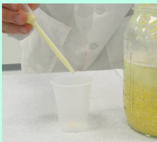
Transfer extract to cup, about 3-4 pipettefuls

Avoid pulling up particles when drawing sample