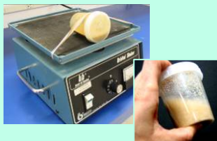
Shake mechanically or by hand