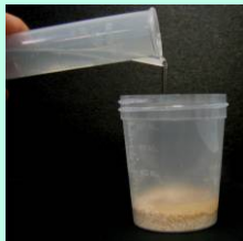
Measure tap water, add to ground sample