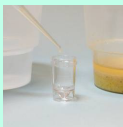
Add Buffer to vial first, then add extract; mix well with pipette tip

containing the DON residues will be used in testing. In some instances a foamy layer will float above the desired top layer.