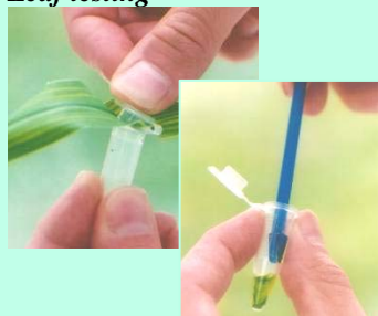
Obtain leaf tissue, grind