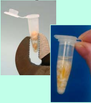
Crush single seed, extract