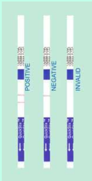
Any clearly discernable pink Test Line is considered positive