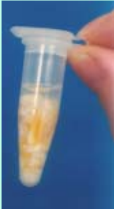
Extract Seed Sample