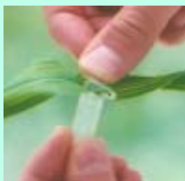
Obtain Leaf Tissue