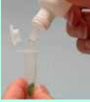
Add Buffer, then shake