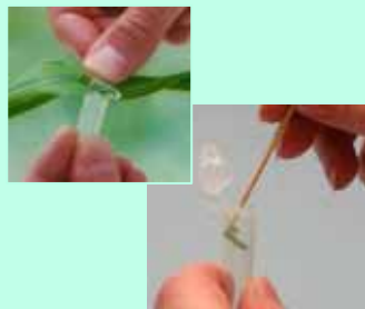
Obtain leaf tissue, push down