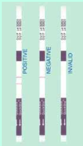
Any pink Test Line is considered positive