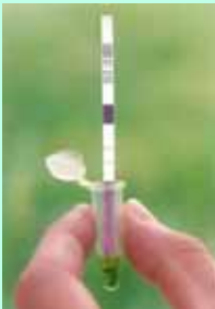
Insert QuickStix Strip