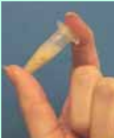
Extract seed sample