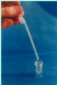
Pipette sample into vial