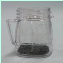
Weigh sample into blender jar, grind