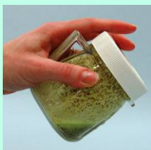
Shake to mix, allow to settle briefly

For example: a 332-seed sample with an average weight of 0.0033g: (332 \times 0.0033 = 1.06 \text{ g} \times 5 = 5.3 \text{ mL tap water})