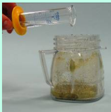
Add calculated volume of water