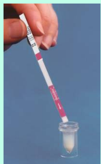
Add QuickStix and read the results