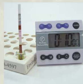
6. Add a test strip to vial, wait 10 minutes