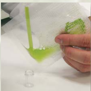
4. Draw up extract with pipette