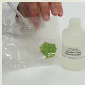
2. Add one pipette (5mL) of buffer