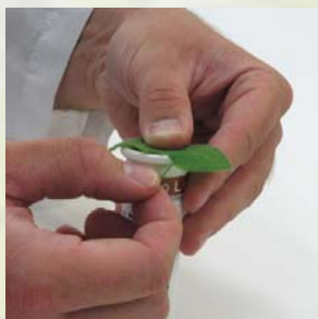
Tear a leaf sample