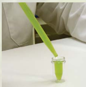
5. Fill vial with extract