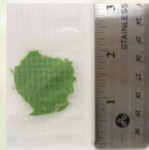
Leaf size is about 1 inch (2.5 cm) in diameter