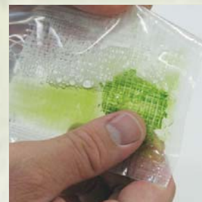
3. Massage the buffer and leaf well