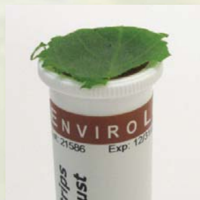
Use the QuickStix tube as a template