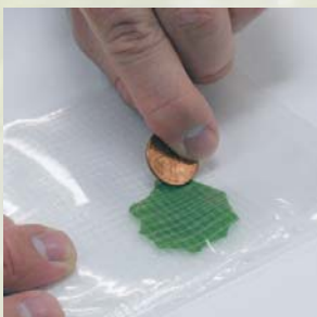
1. Place leaf in mesh bag and rub with coin