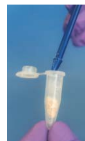
Add the sample and grind