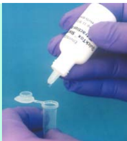
Add 15 drops of Extraction Buffer