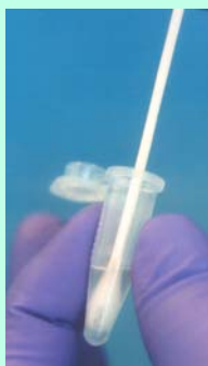
Insert the swab and swirl