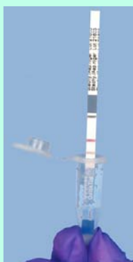
Insert strip and run for 5 minutes