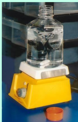
Prepare Wash and Extraction buffer