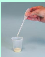
Transfer extract to cup, about 3 pipettefuls