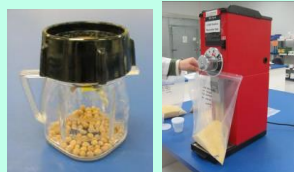
Choose grinding method