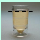
Fill vial to ridge with extract