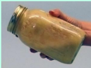
Shake, wetting entire sample