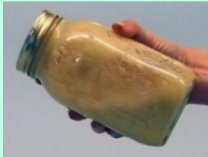
Shake, wetting entire sample