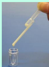
Transfer of clarified extract to a reaction vial using a fixed volume transfer pipette