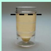
Fill vial to ridge with extract