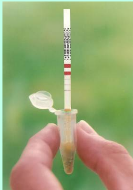
Insert Strip, read results

Any clearly discernable pink Test Line is considered positive