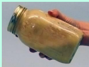
Shake, wetting entire sample