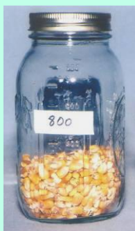
Weigh the sample into a glass Mason jar