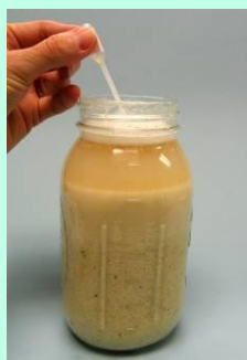
Avoid pulling up particles when drawing sample