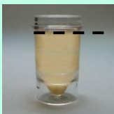
Fill vial to ridge with extract