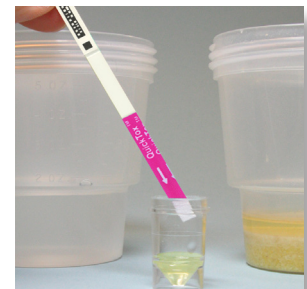
6. Add the QuickTox Strip; wait 10 minutes for results