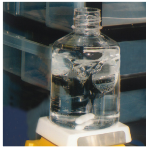
Prepare Grain Buffer from Concentrate