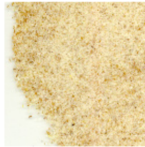
Collect and grind a representative sample per Product Insert instructions