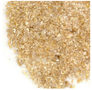
Ground too coarse = improper extraction