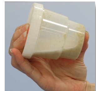
3. Shake on mechanical shaker (or vigorously by hand) for 30 seconds