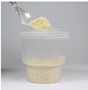
1. Add a 20 to 50 gram sub-sample to container

(more detailed instructions in the Product Insert)