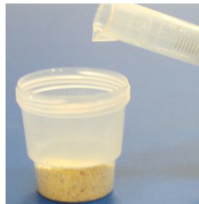
2. Add 5 mL/gram room temperature Grain Buffer (e.g., 100 mL for 20 gram sample)