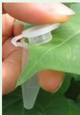
Obtain Leaf Tissue

Contact EnviroLogix to order bulk-packaged kits. Bulk kits include EB2 Extraction Buffer Concentrate. To prepare 1 liter, mix 50 mL 20X Concentrate with 950 mL of distilled or deionized water. Store refrigerated when not in use; allow to come to room temperature before using.